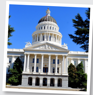
CalSPAC represents 17 member leagues to policy makers at the national, state and local level

Special thanks to all the people that come together to make this possible every month! Our speakers, one of our sustainers for goodie bags, private donors for cake and presents, a local restaurant for pizza and soda, and Junior League members who raise money every year to help those in our community with fun and meaningful events such as these!